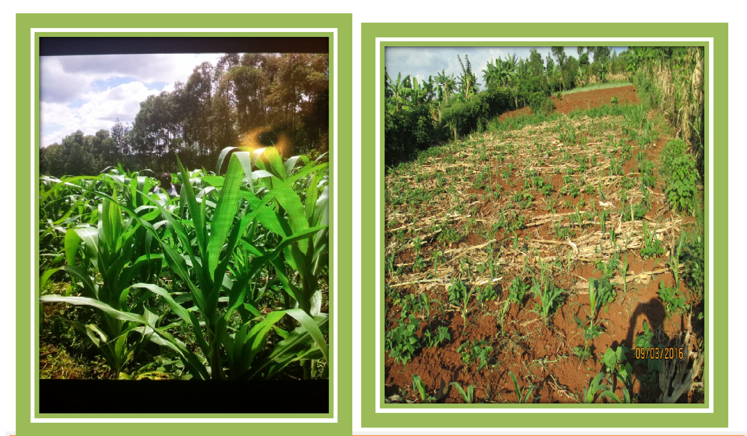
With your financial support, these women were able to lease two farms where they planted corn and beans. They hope this project help them generate some income. It has been so dry and the beans did not so well.